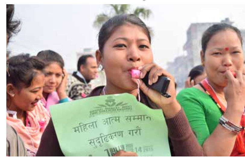
One Billion Rising - celebrating womanhood

Rapid unplanned urbanisation has contributed in unsafe urban environment for women and girls. Violence against women and girls, especially in public space, is one of the major hindrances for women's empowerment, which bars them from enjoying their right to freedom, mobility and security.