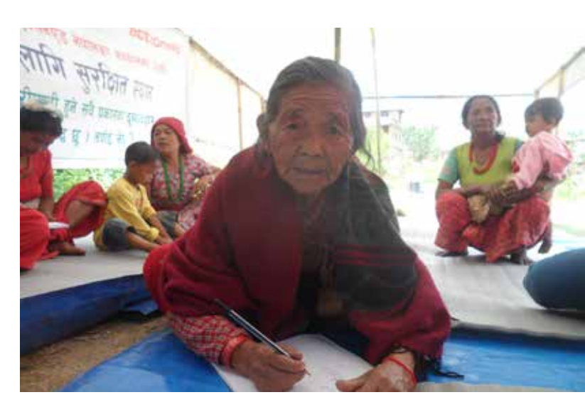
The power of literacy - even old age doesn't bar from learning

There is a hope that the government will make more investments in the education sector as