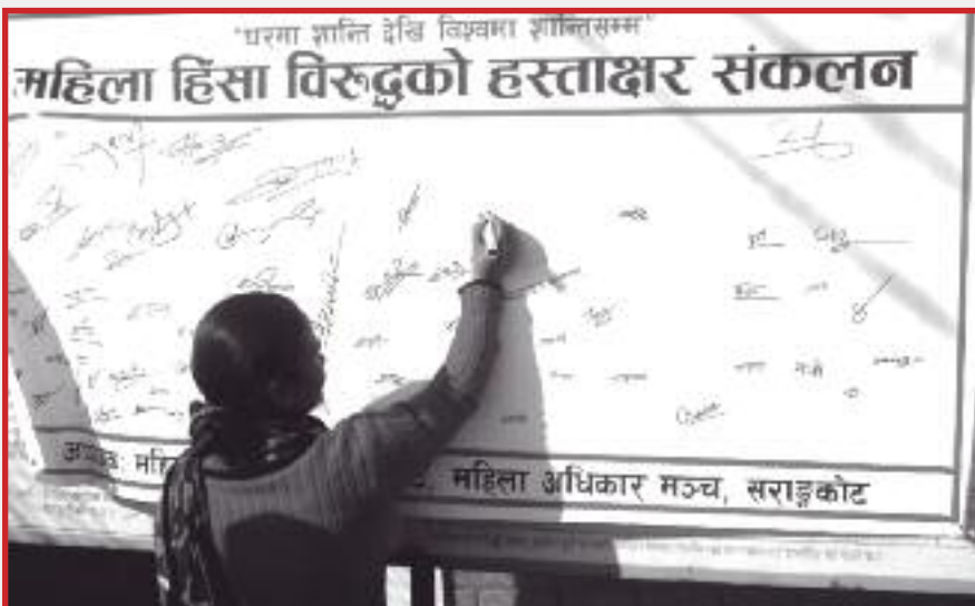
Signature campaign on VAW

Partnership with ASMITA and MAM for national policy advocacy and national women's forum and Women's conference for identity, power and transformation. It has created a platform for women's rights activists and academicians to generate discourse to improve knowledge, build perspective and consciousness in women's movement. The program generated a discussion around women's rights issues and brought academicians, development practitioners and activists on the same platform of different generation. The forum discussed on 25 different papers receiving comments from wider audiences which later will be come out in the form of feminist book.