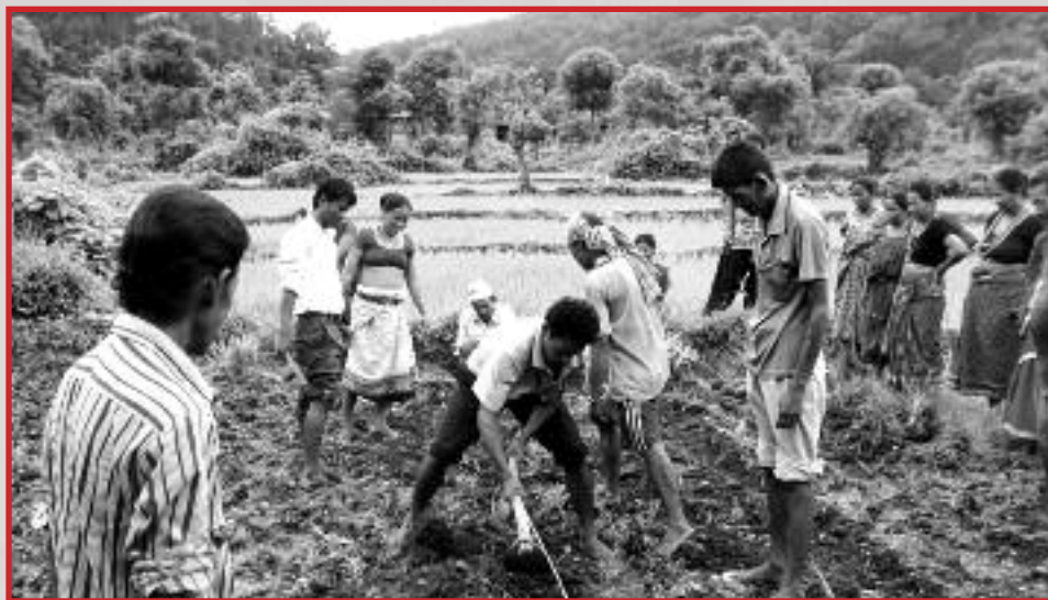
Vegetable nursery training

Women rights to land speaks about women's single and joint land ownerships along with the whole system of state handling land and its endeavours of land reform. Since 2012, the joint land ownership campaign underscoring women's rights to land got momentum with focus on community sensitisations to pressurise political parties, government officials along with land reform agenda. Various local groups like REFLECT Circles, Jana Sarokar Manch, Land Right Forum, Land learning centres, farmers group, MAM and freed Haliya network were utilised actively in organising and mobilising the community people. They conducted awareness programmes and networking for legal orientation, mass conscientisation through media and policy discourse with key stakeholders.