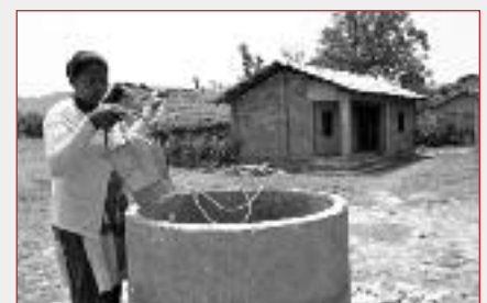
Shelter and drinking water support for freed kamaiya

Most of the freed Kamaiyas are still fighting for livelihood, thus, are compel to work as wage earners at local landlords' farm, brick kiln, or construction site in the urban area to meet their basic necessities. AAIN has facilitated income generating activities such as on/off vegetable farming, poultry farming and also enhanced vocational skills to promote alternative employment opportunities for freed Kamaiya families of Gangapraspur VDC in Dang.