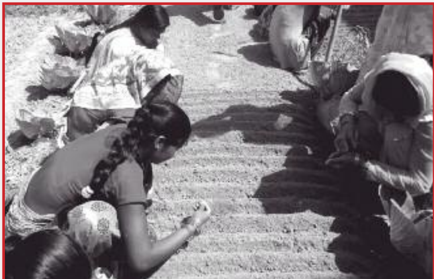
Community involved in farming

A total of 39 PLiP have been able to make a net income of NRs. 5,600 from selling bamboo canes and mango fruits after leasing 3 hectares land of Aishwarya Ban Batika of Lalgadh, Dhanusha.