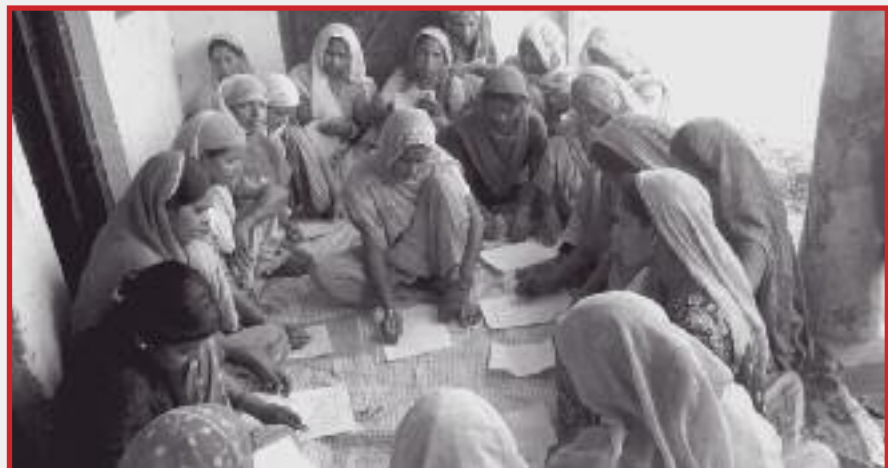
Women discussing on their issues

Street dramas, door-to-door awareness programmes, posters, wall paintings, interactions with stakeholders and PLiP were carried out. MAM capacitated on the legal aspects of domestic violence and regular supports by the LRP partners strengthen MAM thereby empowering women to raise the cases of violence. Owing to several levels of interactions, orientations on women's rights, VAW and GBV, womanhood has become vocal for all the unjust and violence they are going through. The numbers of reported cases of VAW found to be increased due to empowerment of women. Two safe houses have been established in Chitwan and Makwanpur, initiated through Sakcham project, in order to provide victims a secured shelter, counseling and other services.