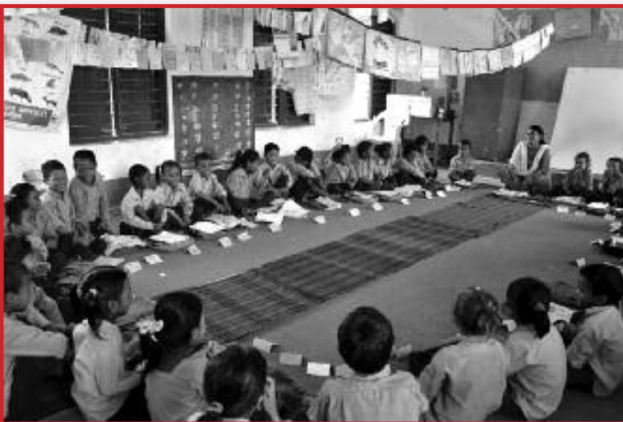
Child center learning approach