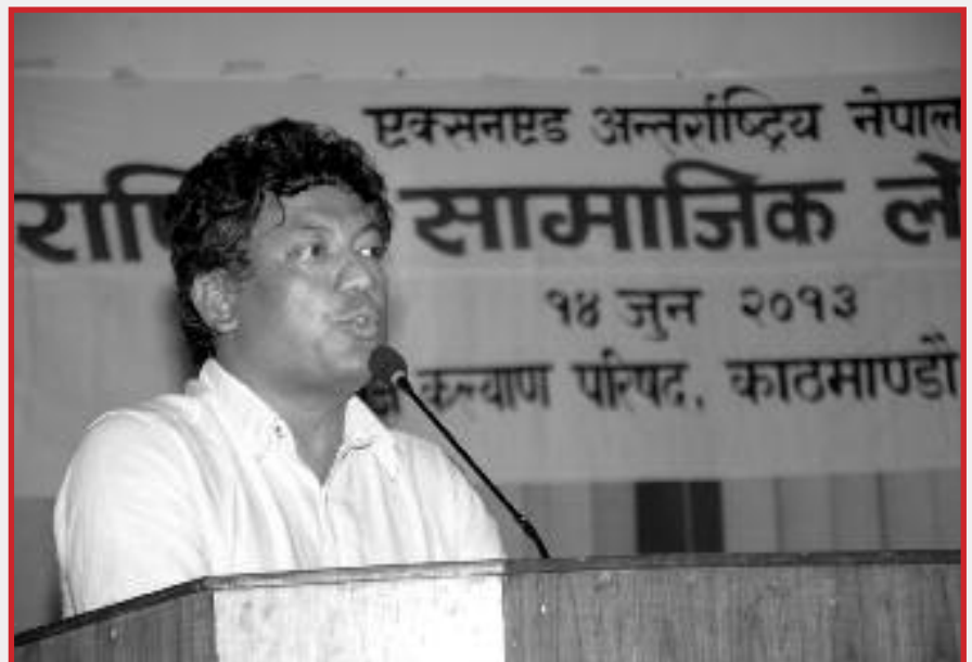
AAIN's tenth national social audit

In 2013, discussion about the most appropriate form of registration was taken forward in consultation with relevant government officials, stakeholders and staff members. Following this, it was decided that AAIN will be registered as a national NGO, and the process to be facilitated from 2014.