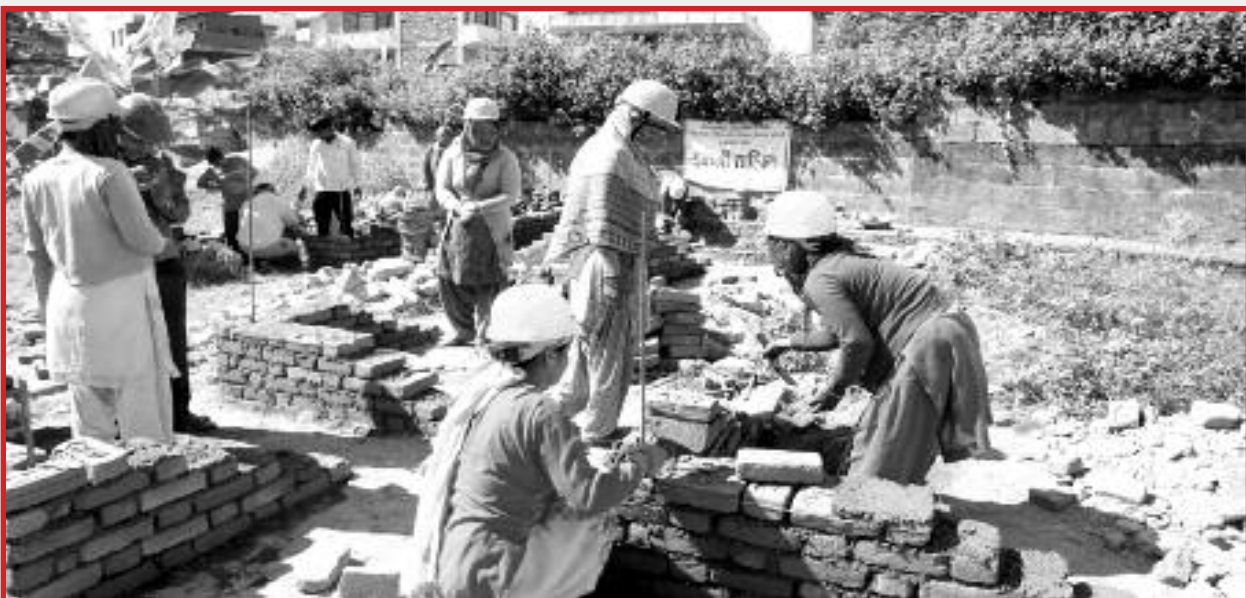
Masson Training in Pokhara