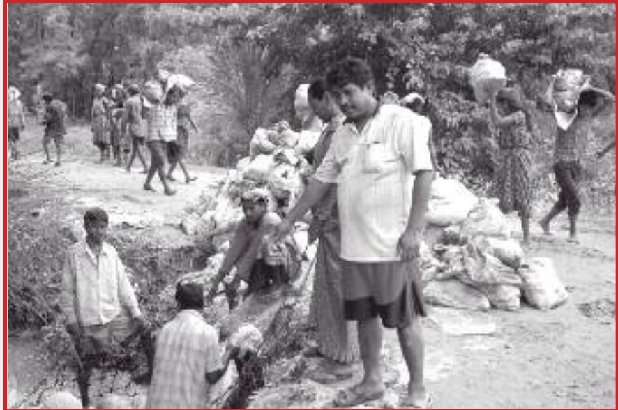
Community involved in road maintenance after being affected by flood in Bardiya

Kolti, the 21st council meeting of Bajura has formally established an emergency fund titled “district level emergency disaster management fund”. A total of NRs. 231, 000 was collected for emergency responses over the period of 2013. Four disaster victims have been supported by this fund. This has been a good practice for generating local resources, building solidarity on disaster management and encouraging the private sectors to uphold their promises of corporate social responsibility as well. Likewise, in most of the LRPs, communities have been able to establish emergency fund thereby getting immediate response in case of disaster occurrence. BDRC project supported NRs. 15, 00,000 for establishing DM fund in the Pokhara Sub-metropolitan City. Municipality has allocated additional amount of NRs. 10, 00,000 which has certainly brought about trust within the