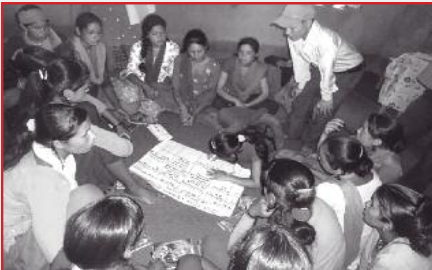
Community based planning process

Participatory Planning Process (PPP) is a bottom up planning process. It decentralises the planning process, allowing the local people and other stakeholders to identify their needs and plan accordingly for fulfilling these needs. It aims to promote the participation of the people themselves in the planning process and to make optimum use of the local resource. It also stresses in the cooperation and coordination of all the key stakeholders and believes that discussion and interactions among them will solve the problems they are facing.