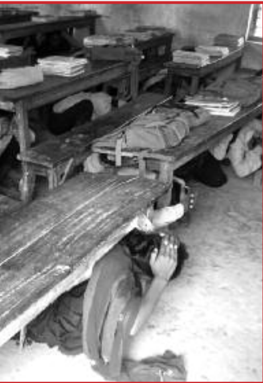
Simulation for Earthquake preparedness

families affected by the flooding in the Karnali River and supported nutritious foods to 15 women after their delivery period. Similarly bags and stationary were supported to around 200 flood victim children of Rajapur area through AAIN's LRP partner KMJS in coordination with District Disaster Relief Committee (DDRC). AAIN and its partners have also extended their supports to the victims of fire outbreaks in various working areas. A fund amounting to NRs. 4000 has been secured and 75 kilos of rice accumulated