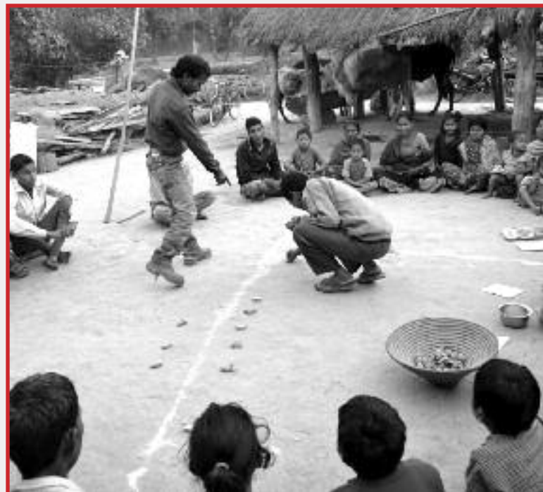
Participatory Community literacy mapping

District Administration Office Bajura organised an integrated mobile camp about the services pertaining to citizenship card, social security allowance, health, veterinary and agricultural services in Piluchaur, Rugin and Kawadi VDCs. Programme staffs facilitated these services from the camp considering hardship of villagers, women and people with disability, PLiP and marginalised people living in geographically remote areas. As a result, they received citizenship cards and availed the health examinations from the camp. Similarly elderly, people with disability, PLiP, Dalits and women received their citizenship cards owing to regular information facilitation and access to camp. The camp was organised for Rugin and Bichhiyan VDCs in Kawadi at the first stage while 9 VDCs in Piluchaur were taken for second stage. Through this mobile camp a total of 675 people got citizenship cards, 200 cases of death got reported, 50 people took migration certificate, 356 people availed veterinary medicines services for their pets while 6 men and 3 women acquired land ownership certificates.