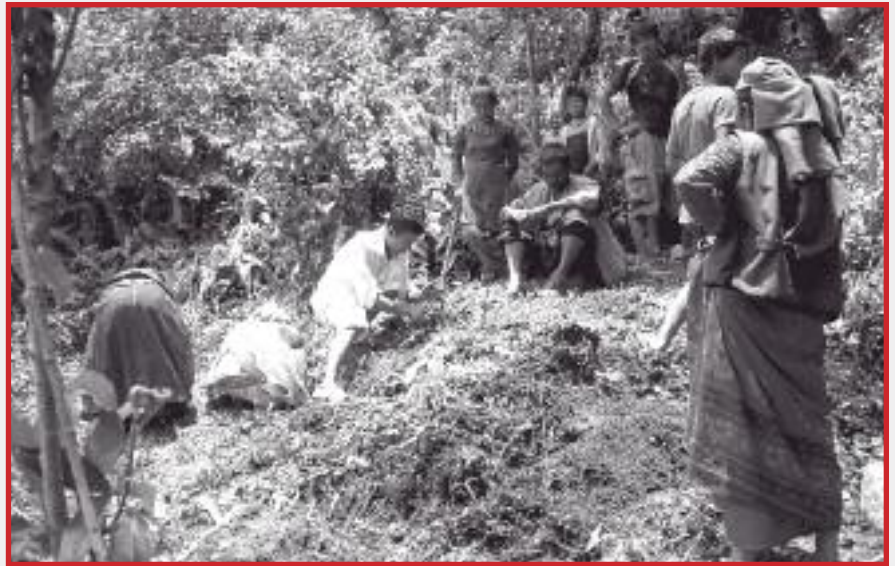
Thami community involved in herbal plantation

Likewise, Saraswati REFLECT Circle has been able to make NRs. 25,000 as net income from selling fishes while leasing a pond of Bhimsen CFUGs at Hadiya VDC in Udayapur. A total of 35 women have been able to represent and take leadership roles in CFUG in Tehrathum district. Similarly, Thami community of Kalingchowk and Khopachu VDCs of Dolakha succeeded in reaching an agreement for leasing 10 hectares of land for 10 years with Gaurishankar Conservation Area for collective herbal farming. They have earned NRs. 350,000 this year directly benefitting 65 families.